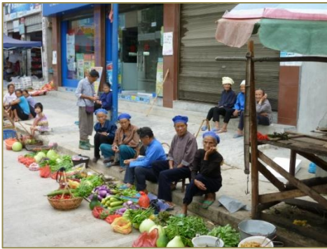
Street Market in Guizhou, picture taken during fieldwork

This year's field site was in Liping, Guizhou (貴州黎平). Fifteen trainees were led by a group of experienced field scholars to conduct historical/anthropological field work in villages of ethnic group Dong. The key perspectives and site methodologies are framed in response to anthropologist James Scott's influential theory on minority population and state-building. Long walks, field observations, interviews and intensive discussion were core elements of the program, distinguishing it from traditional classroom-based workshops.