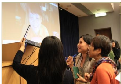
Audience continued their exchange with the director over video conference even after the formal session was over