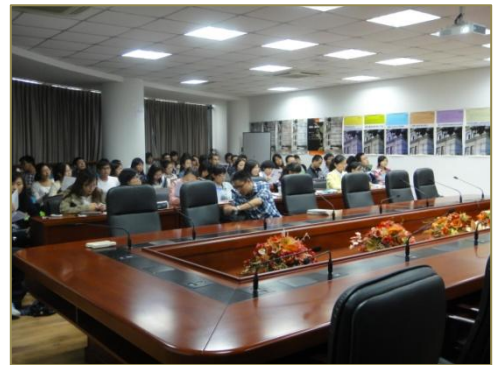
Information session at East China Normal University, September 20, 2011