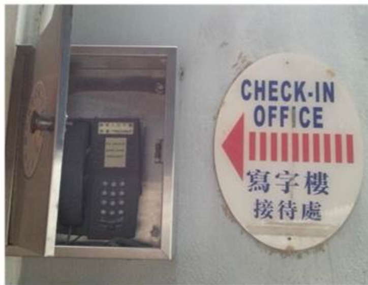
8. Open the box and dial the number indicated on the telephone inside. Someone will come out shortly to assist you with the check-in.