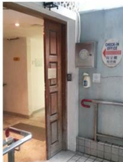
6. At the end of the ramp, there will be a door.