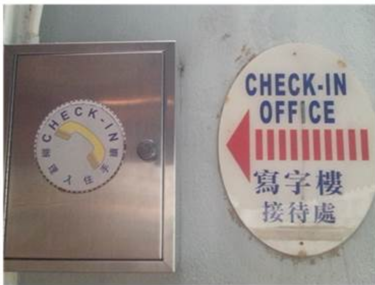
7. Next to the door is a metal box and a check-in sign.